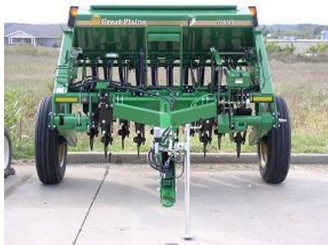
7' Great Plains Drill—$8/AC * 10 AC minimum Requires a 60 HP tractor