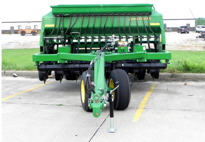
10' John Deere—$9/AC * 10 AC minimum Requires a 80 HP tractor