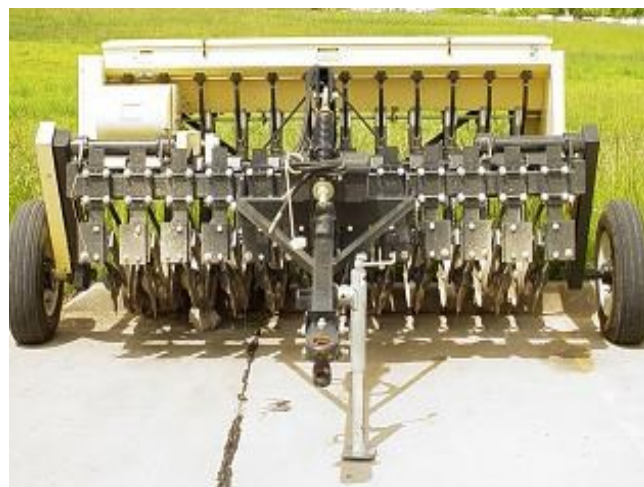
8' Truax Drill —$10/AC Requires a 60 HP tractor