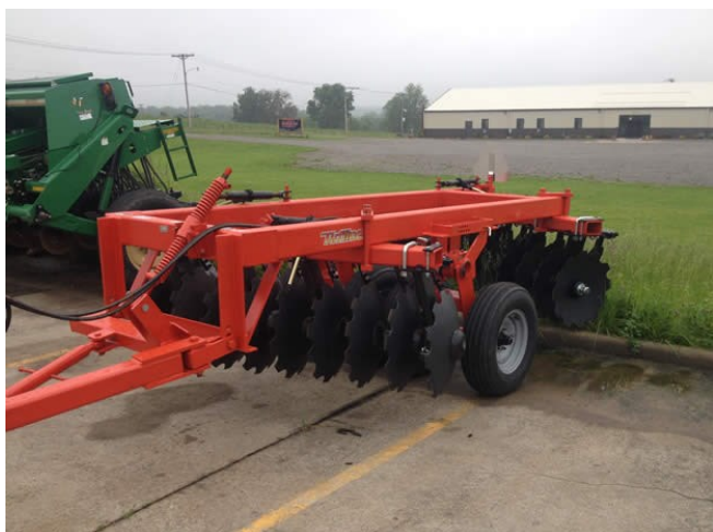
Offset Disk —$30/day or $75 /weekend Requires a 60 HP tractor